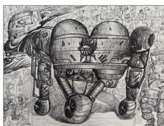
Qingke Tian (China / Age 11)

The future universe will produce a lot of garbage because of human development behavior. This car, a bit like a robot, is designed to clean garbage in the universe. It’s a cleaning vehicle which protects environment.