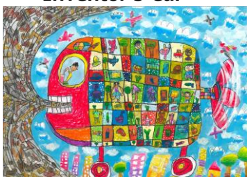
Kawiphath Thonthaisong (Thailand / Age 7)

The concept is “recycling garbage to valuable products for everyday usage”. This car is designed to be a garbage sucker. It will suck all the garbage in and transform it to new products so that people can reuse them again for their daily life. Recycled garbage products will also be donated to people who are in need to support their life usefully.